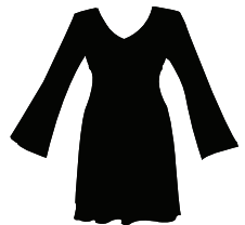
V-Bird Dress L/S VSD1B