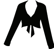
Kimono Kardi VSK1