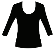
3/4 Scoop Top VST4