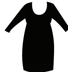
3/4 Scooby Doo Dress VSD2B