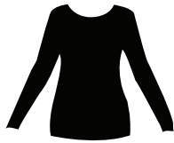
Scoop Top VST3