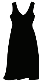
V-Bird Midi VSD1C