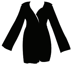
Hooded Kimono VSK2