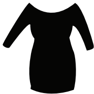
Good Night Mini VSD4B