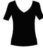
Cocktail Tee VST6