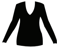
Double Jo VST5